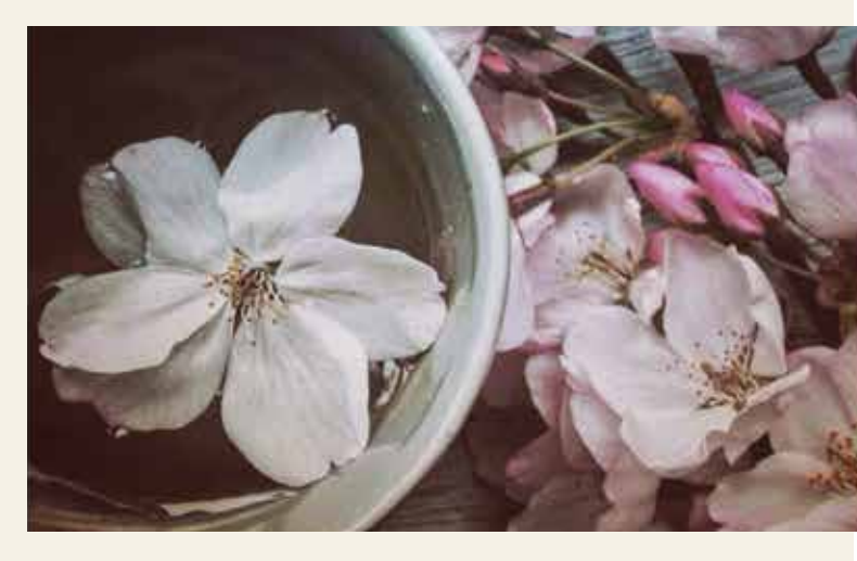
Sweet surprises, sacred experiences and in depth teachings await those courageous enough to accept the

and every day, freedom to BE, and freedom to dance to the beat of your own (heart) drum. If you do choose to inJoy a day of radical rest and stillness, then your stunning accommodation and natural surroundings are sure to provide you with the cosiest of nests.